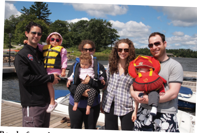
Ready for a boat ride