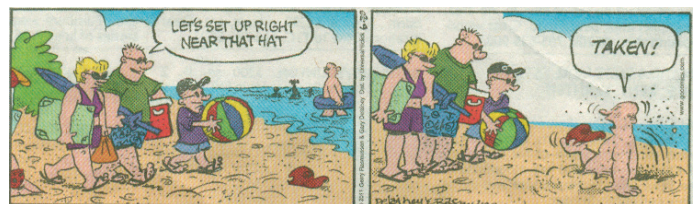
Betty

We look forward to seeing you throughout the seasons at Tory's. On behalf of your Board of Directors, we wish you a safe, fun, and healthy summer.