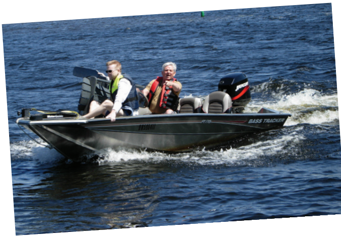
The Bonds to the rescue