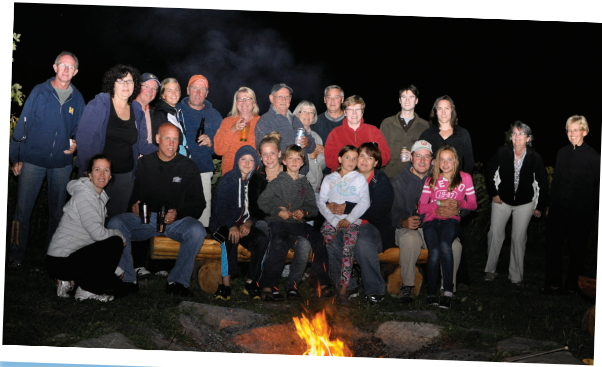
Week 10 Campfire